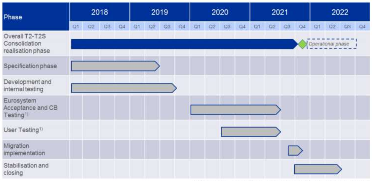
1) Preparation and Execution phase are included to equal proportions